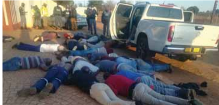
Two of the suspects that were arrested are from Rustenburg.